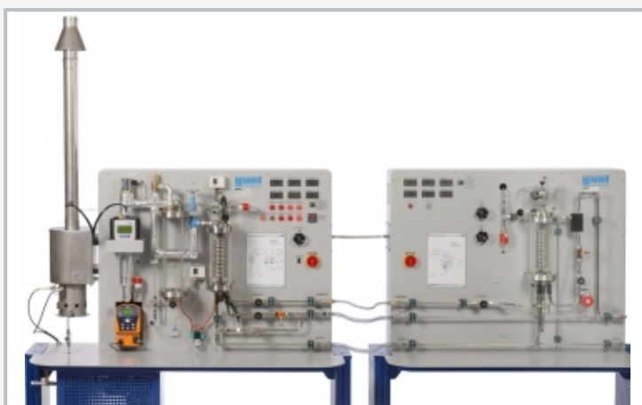
Left: ET 850 steam generator; right: ET 851 axial steam turbine; set up ready for operation, together they form a steam power plant